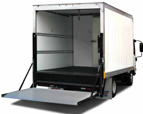
Mickey Van Bodies are available with a variety of lift gates and ramps, bumper types and doors.