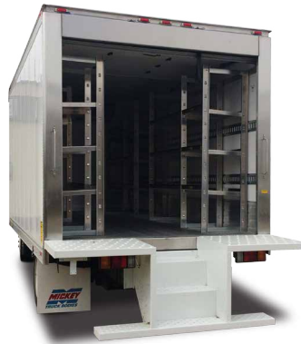
Chicago Style Step Bumper