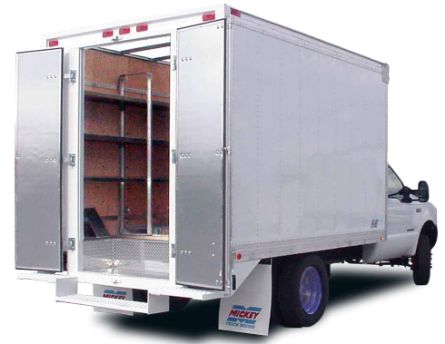
Rear Dual Swing Door