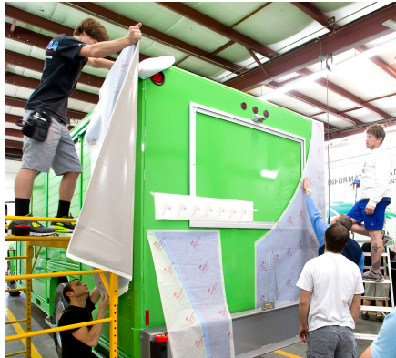
A Mickey truck body gets "wrapped" by a McKenzie installer.