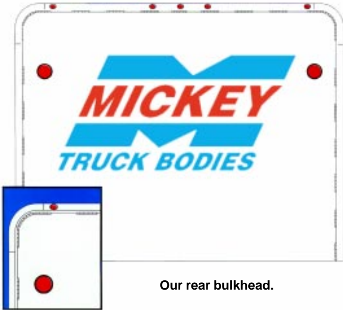
Our rear bulkhead.

No Bondo. No Rivets. No Caulking. No Cracks. No kidding.