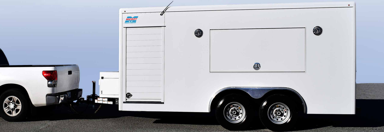
Great curb appeal

With Mickey's new Party Time Trailer, it's B.Y.O.B. (Bring Your Own Beverage) We've taken care of E.E. (Everything Else)