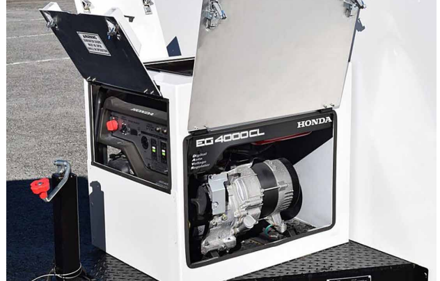
Generator w/ anti-theft shroud (optional)