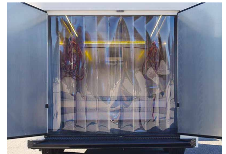
Large rear entry doors for easy access and forklift loading