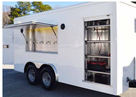
Front compartment w/ shelving for cups, taps, promotional items