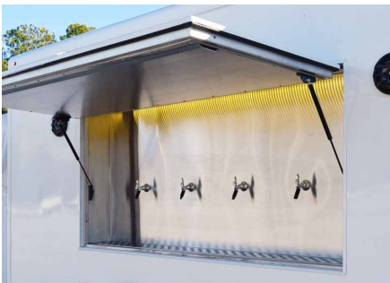
Multiple tap options available; door serves as built-in awning