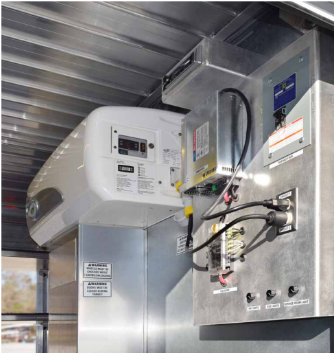
30 Amp 125/250V Inlet Shore Power; Air unit GOVI Arktik 2000US 110/v (cools to 15 °F)