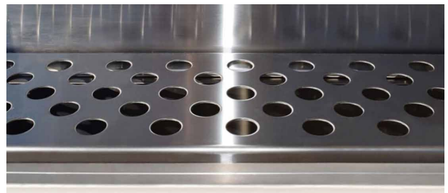
Stainless steel drain trough