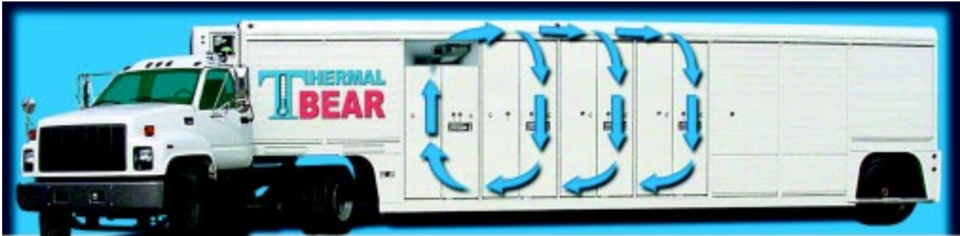
Thermal Bear features condensing unit with nationally-branded, ceiling-mounted evaporator for superior cold air distribution and improved protection from product loads. Cold plate application available.