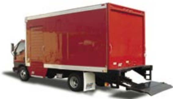
Easier to Operate