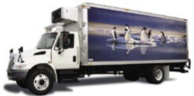
Greater Thermal Efficiency