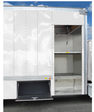
Flip-down door compartment (bottom left) provides versatile space for tools and other items useful at a vending site.