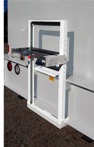
Rear Hand Truck Rack